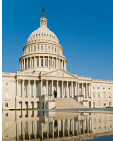
WILL WASHINGTON'S PRESSURE CHANGE IRAN'S CALCULATIONS?

On the other side, Washington and Brussels believe that increased pressure will change Iran's strategic calculations and compel it to compromise. Analysts describe the situation as a game of pressure versus endurance, with occasional outbursts such as the recent hiccup in Iran-UK relations.