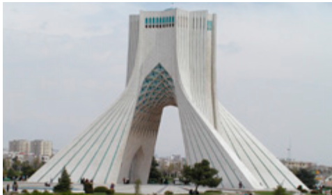
AZADI MONUMENT, TEHRAN