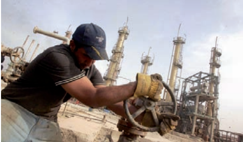
TURNING ON THE TAPS?